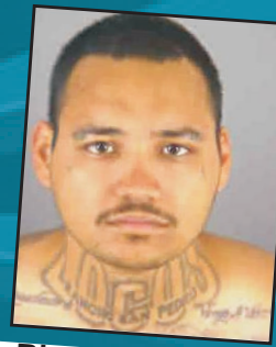
Riverside's Most Wanted Need your help!